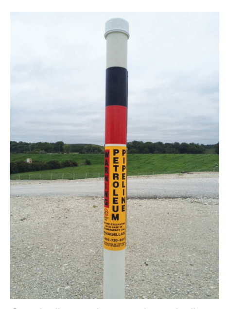
Our pipeline markers can be typically identified by the black and red bands at the top.

Magellan Midstream Partners, L.P., a wholly owned subsidiary of ONEOK, Inc., is a publicly traded limited partnership, principally engaged in the transportation, storage and distribution of refined products and crude oil. Magellan operates a 9,800 mile refined products pipeline system with 54 connected terminals and two marine terminals (one of which is owned through joint venture) and a 2,200 mile crude oil pipeline system.